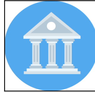
Hatton National Bank PLC